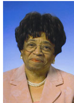
Democratic Representative Tommie Brown (Dist. 28, Hamilton County)