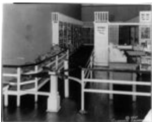
Interior of Piggly Wiggly store, Tenn., showing entrance turnstile with small wicker shopping baskets, and check-out counter; 1st self-service grocery store in U.S.