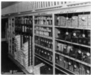
Shelves in a Piggly Wiggly self-service grocery store in or near Memphis, Tennessee