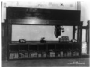
Interior view of a Piggly Wiggly self-service grocery store showing scales on top of counter and paper bags stored under counter