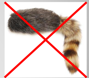
David "Davy" Crockett