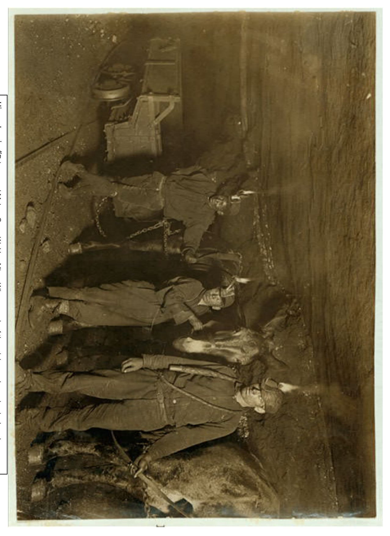
machinery. Location: Gary, West Virginia.." Library of Congress. Loc.gov. June 23, 2016 <a href="https://www.loc.gov/resource/nclc.01052/">https://www.loc.gov/resource/nclc.01052/</a> Hines, Lewis. "Drivers and Mules, Gary, W. Va., Mine, Where much of the mining and carrying is done by