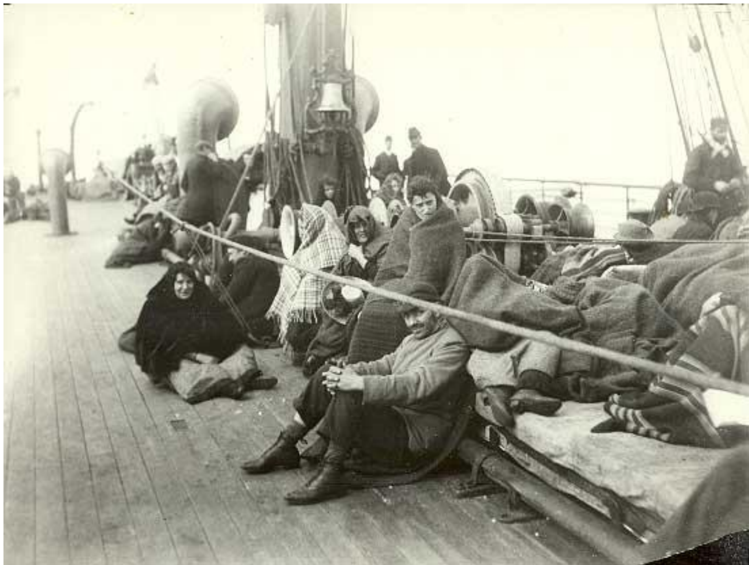
Immigrants aboard a ship headed to New York, circa 1892