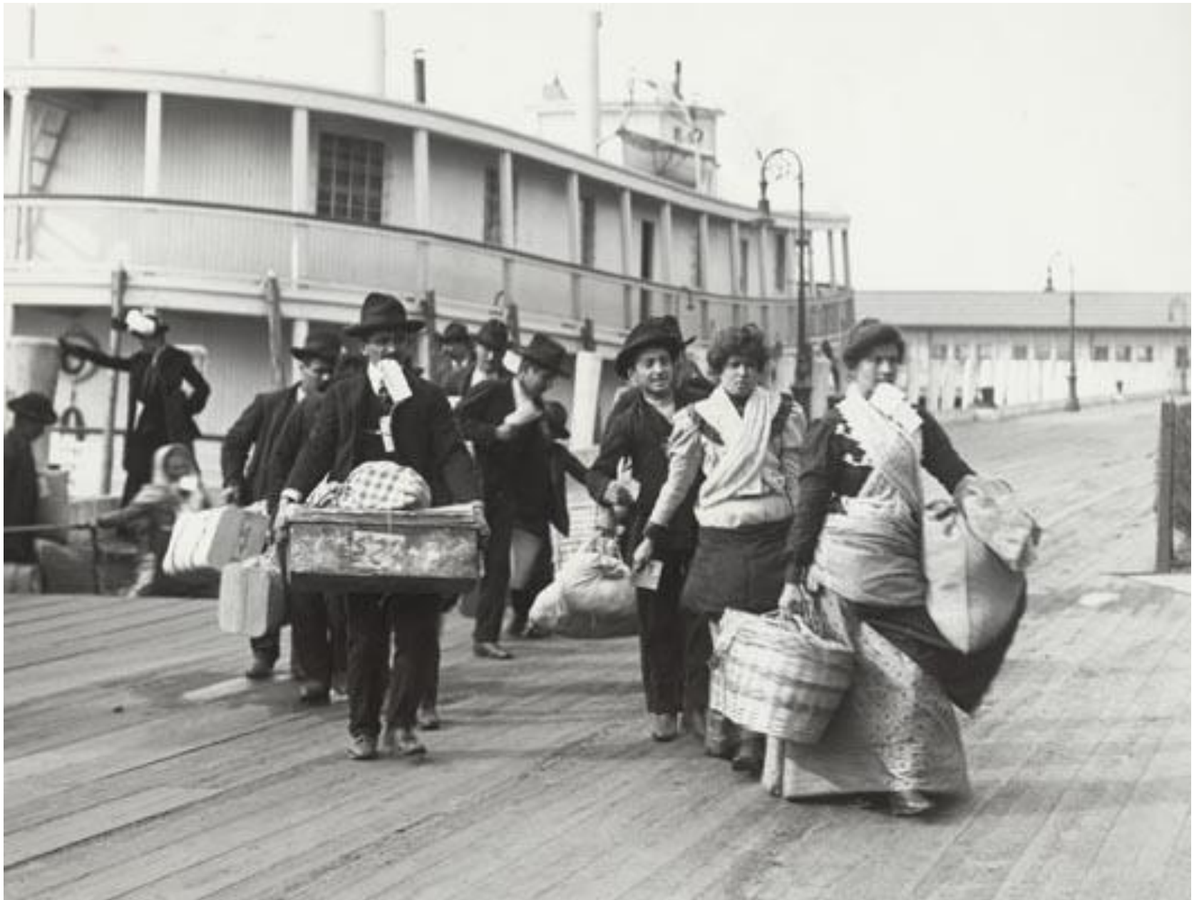
Immigrants arriving at the Port of New York, circa 1900