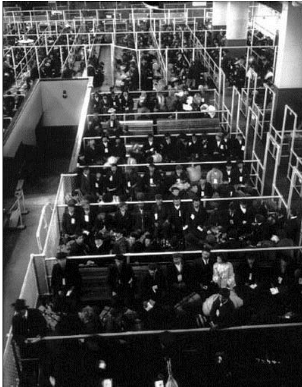
Waiting room at Ellis Island, 1907