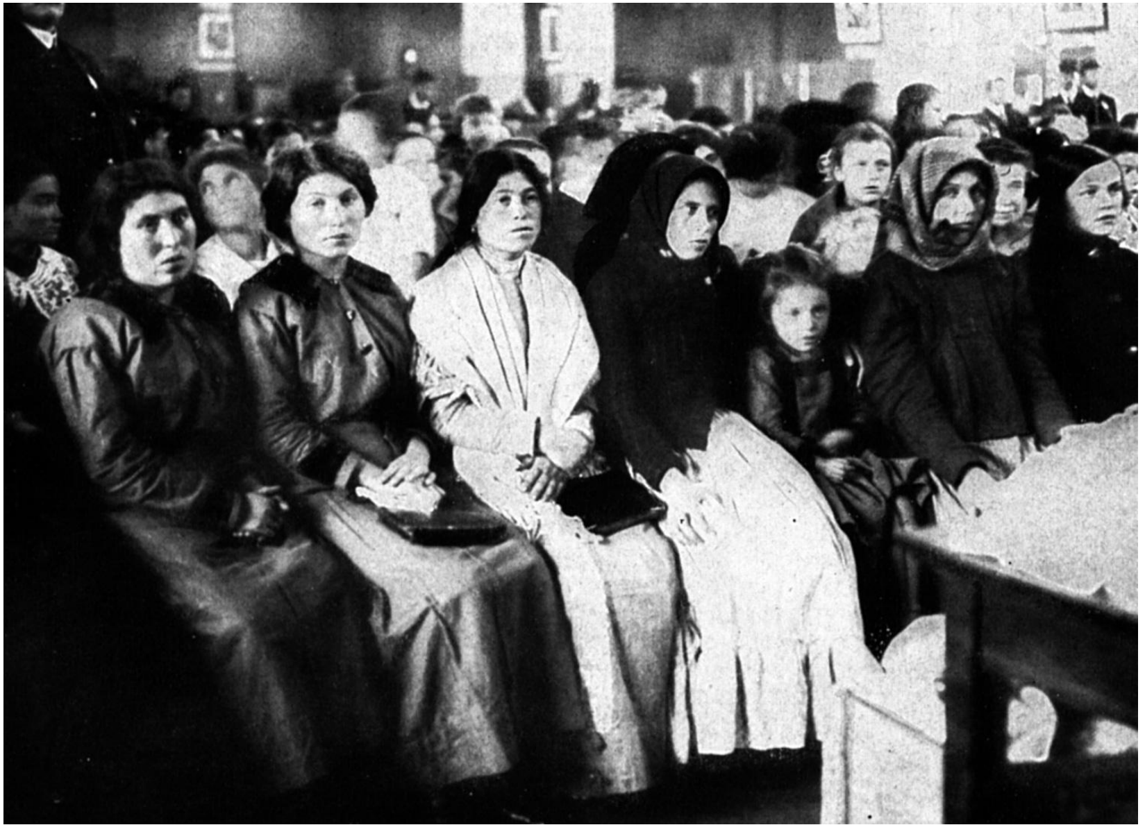
Step 2: The Mental Exam