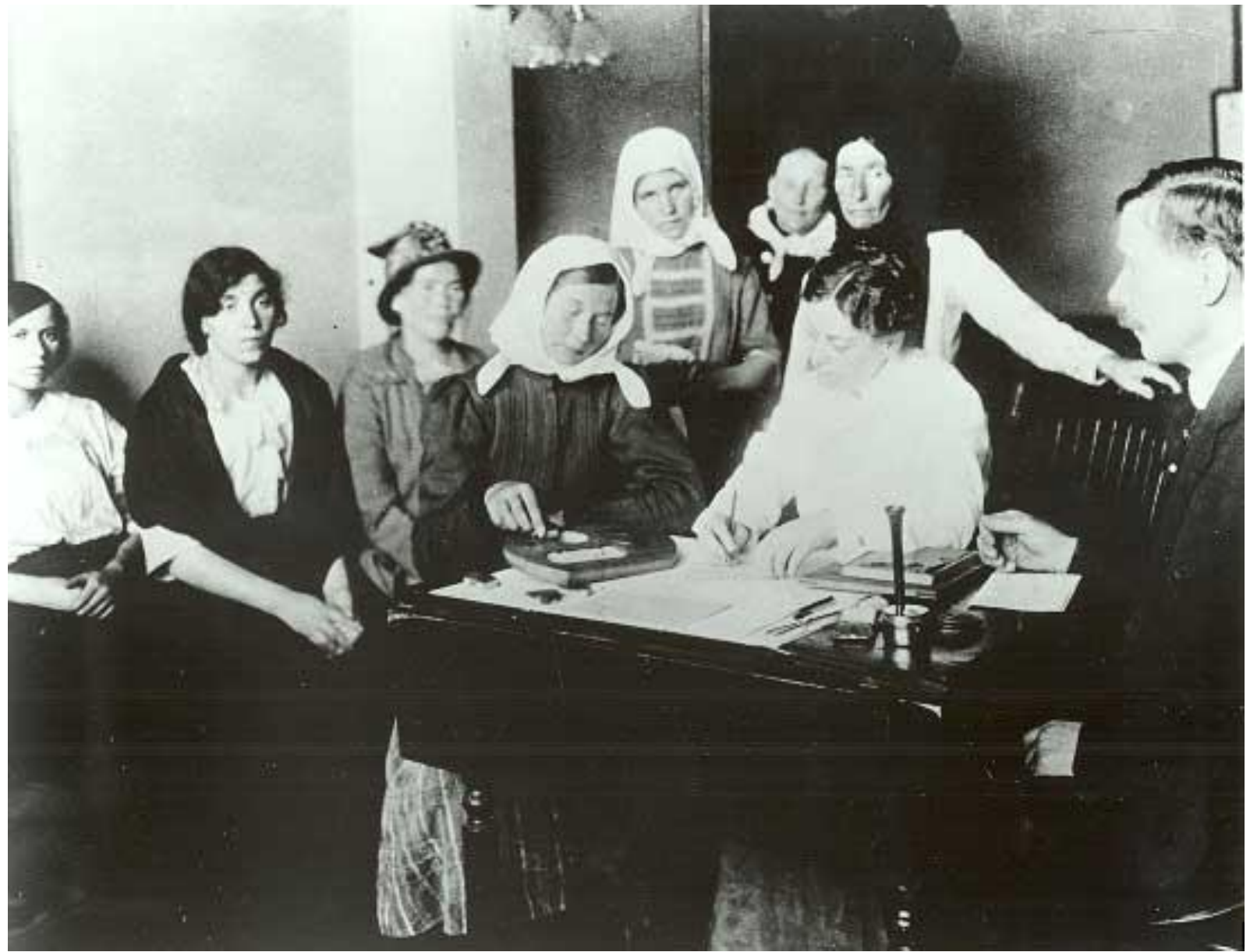
Immigrants taking a written test