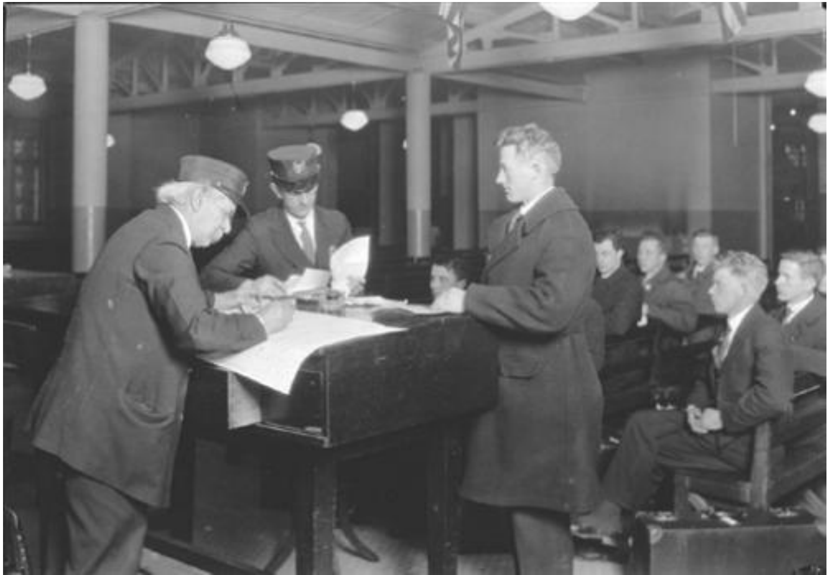
Step 3: The Legal Exam