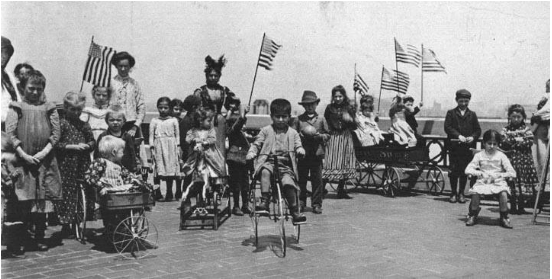
Roof playground at Ellis Island