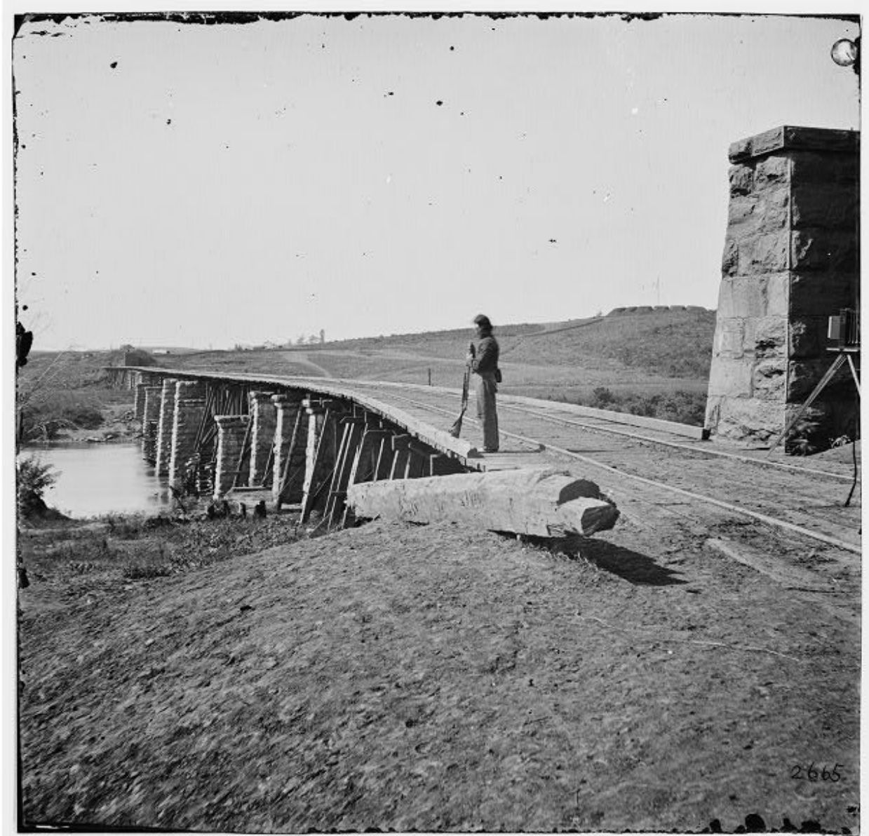
George Barnard, "Bridge at Strawberry Plains," 1864, Library of Congress