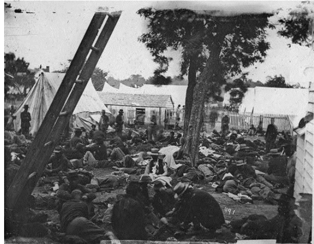
[Savage Station, Va. Field hospital after the battle of June 27] [1862 June 30]

What kind of medical care did soldiers receive during the Civil War? How do I interpret primary sources about Civil War medical care?