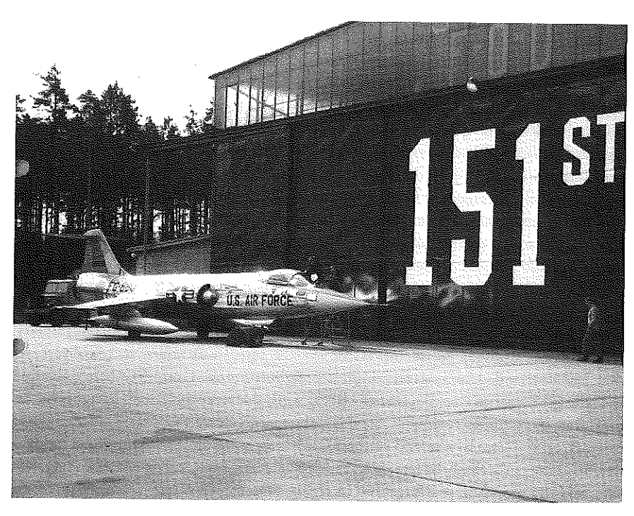
F-104 Starfighter in front of the 151st hanger at Ramstein Air Base, now with USAF markings.

h the other two ANG F-104 squadrons uts. Ibid.