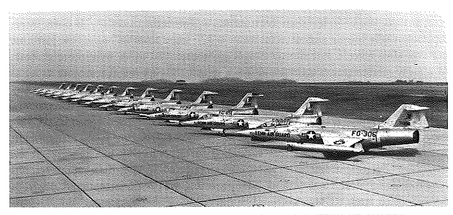
F-104 Starfighters from the 151st Air National Guard, their "TENN AIR GUARD" markings still in place.

dance of American and German ing intercepts from ground radar to take off from Ramstein within to protect unarmed aircraft flying ever the course of the deployment. North Atlantic Treaty Organization of the took a round-about path, orce requirement for a "high perced into an "air superiority weaper and dominate airspace. By 1956,