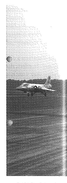
F-104 Starfighter from t From the Air Force F

Back in the states, the commander of Air Defense Command had already endorsed the Air National Guard's capabilities, calling it "an integral part of our total