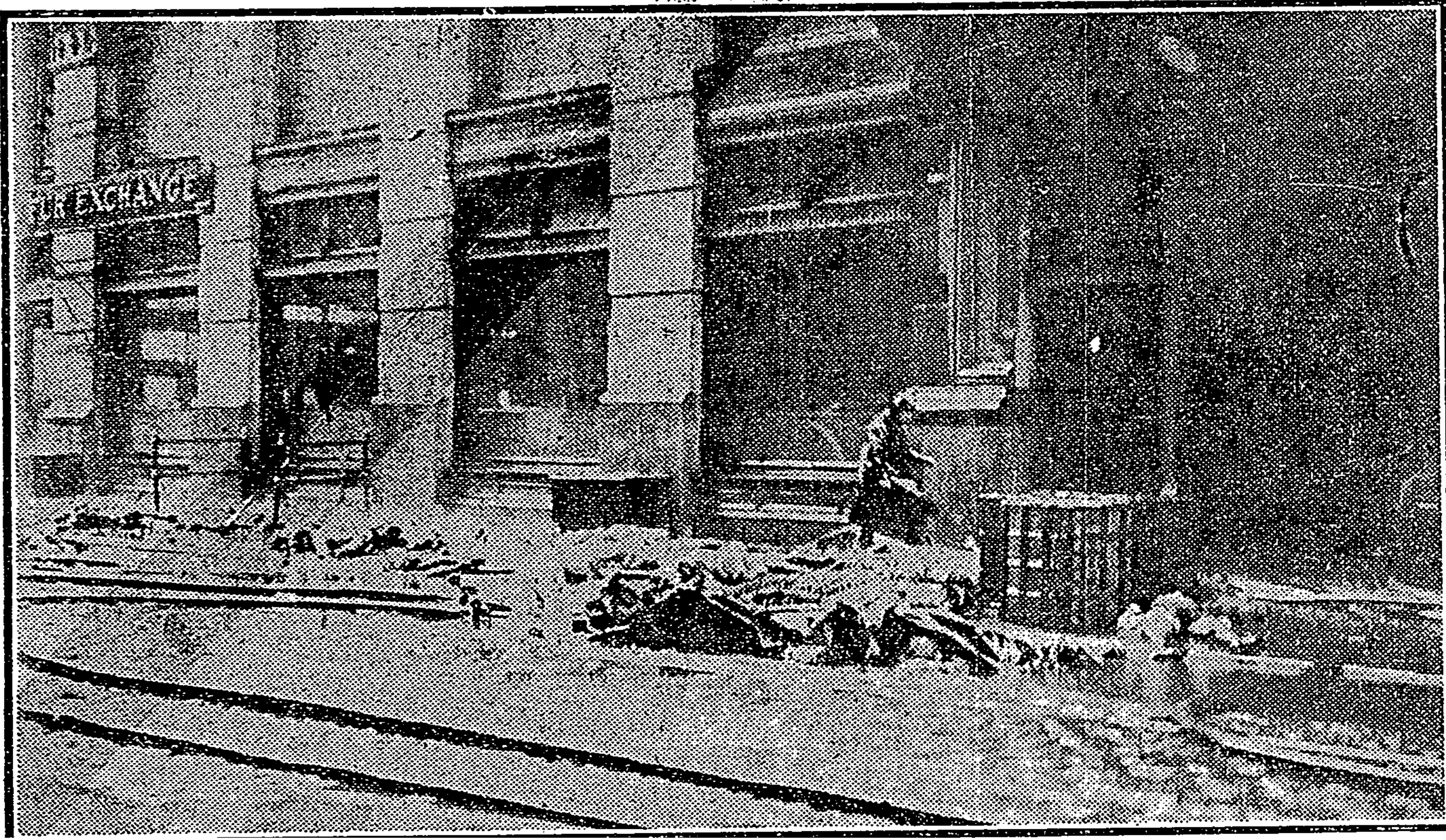
One Hour After This Picture Was Taken Two of the Victims Were Discovered to be Alive.

burned and turned to death were found principally on the ninth floor, where over 50 perished in front of a closed doorway, which they had jammed shut; in the two elevator shafts 30 or more were piled up in the bottom after the elevator had ceased running; at the bottom of a single iron fire escape in an air shaft in the building's rear and on the fire-proof stairways between the eighth and ten stories, up which the fire from the burning sewing machines on the eighth floor went with a rush of air toward the roof.