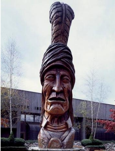
"Statue of the Cherokee leader Sequoyah, Cherokee, North Carolina."