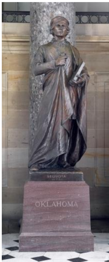
Statue of Sequoyah in the Hall of Fame at the U.S. Capitol. Courtesy of the Architect of the Capitol.