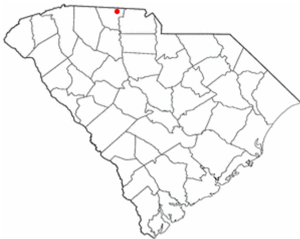
King’s Mountain, York County, S.C.

Alerted that the Overmountain force were coming by Sevier’s deserters, Ferguson opted to retreat southward. The British officer ordered his men to take up a position on the pine covered King’s Mountain, the high point in a sixteen-mile mountain ridge running across the border separating South from North Carolina. Ferguson’s confidence that he could successfully defend his position against any force was misplaced.