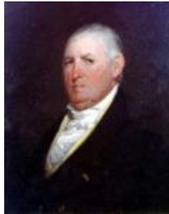
Col. Isaac Shelby