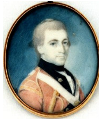
Maj. Patrick Ferguson

The Battle of King's Mountain was a unique battle in the American Revolution. With the exception of one lone British officer, it was fought entirely between Americans; no British troops fought at King's Mountain. The victory achieved by brave fighting patriot frontiersmen, known as the Overmountain Men, at the Battle of King's Mountain has been widely regarded as the turning point of the Revolutionary War in the Southern theater.