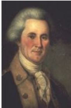
Col. John Sevier