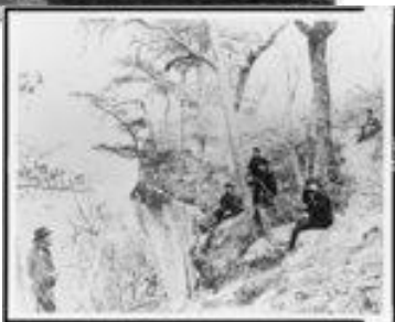
General Ulysses S. Grant and five other men on Lookout Mountain, Tennessee