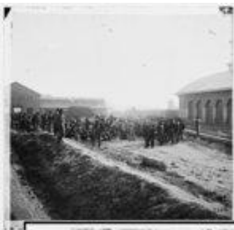
Chattanooga, Tenn. Confederate prisoners at railroad depot