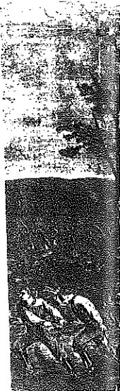
The battle of Ringgold, Georgia, November 28, 1863.

The next mg we left Chicamauga Station under fire from an advancing Battery leaving after the rearguard—the same night we left Graysville just before dark—I was sent back with important orders but before I could return the enemy had intercepted the line of march of the rearguard to which I was sent, and I and one of the escort were fired on while returning by a long line of the Enemy on the side of the