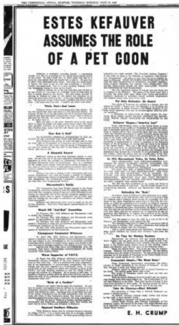
Estes Kefauver Assumes The Role of a Pet Coon

These sources can be found at the Tennessee State Library and Archives Virtual Archive. Click on the link to the TeVA site. You can download jpegs of the files by clicking the download icon in the upper right hand corner.